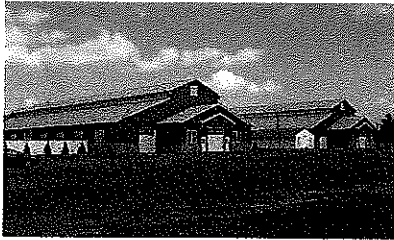
3 County Fair Northampton, MA

200 tractors wanted to participate in a 2 mile tractor parade on September 2 nd 2017 to commemorate the 200 Anniversary of the Three County Fair.